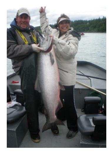
7 Nights Lodging @ Gone Fishin' Lodge 5 Guided Fishing Trips 1 Salmon Trip @ Kenai Or Kasilof River 1 Deep Sea Halibut Trip @ Cook Inlet 1 Upper Kenai Trip for Red Salmon 1 Fly-Out for Red Salmon/Bear Viewing 1 Seward Multiple Species Trip for Halibut & King Salmon $3195.00

FIVE DIFFERENT FISHING TRIPS! FIVE DIFFERENT LOCATIONS! FIVE DIFFERENT FISHING TECHNIQUES!